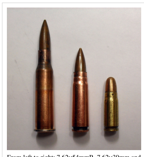
From left to right: 7.62 \times 54 mmR, 7.62 \times 39 mm and 7.62 \times 25 mm Tokarev.

In the 1960s Yugoslavia experimented with new bullet designs to produce a round with a superior wounding profile, speed, and accuracy to the M43. The M67 projectile is shorter and flatter-based than the