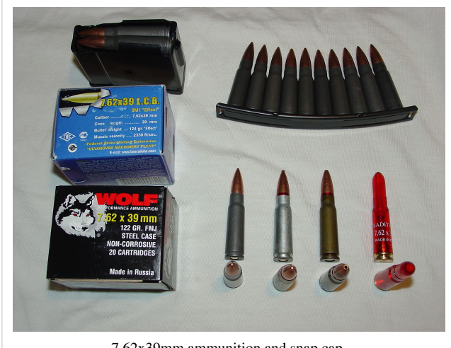
7.62x39mm ammunition and snap cap.