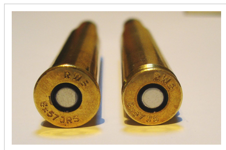
8×57 IRS and 8×57 IS (a.k.a. 7.92×57mm Mauser) sporting rounds. The rimless cartridge on the right is used in repeating and self-loading rifles, the other is for breech-loading only (and therefore rimmed)