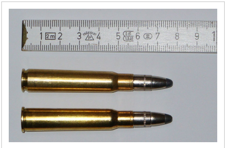
7.92×57mm Mauser (above) and the rimmed 8×57mm IRS cartridges loaded with Brenneke TIG hunting bullets

The 7.92×57mm Mauser is a common chambering offering in rifles marketed for European sportsmen, alongside broadly similar cartridges such as the 5.6×57mm, 6.5×55mm, 6.5×57mm, and the 6.5×68mm and 8×68mm S magnum hunting cartridges. Major European manufacturers like Zastava Arms, Blaser, Česká Zbrojovka firearms, Heym, Mauser Jagdwaffen GmbH and Steyr Mannlicher produce factory new 7.92×57mm Mauser hunting rifles and European ammunition manufacturers like Blaser, RUAG Ammotec/RWS, Prvi Partizan, Sako and Sellier & Bellot produce factory new ammunition. [4] In 2004 Remington Arms offered a limited-edition Model 700 Classic bolt action hunting rifle chambered for the