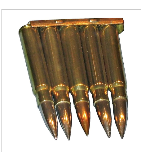
German stripper clip with five 7.92×57mm IS cartridges for the Gewehr 98 and Karabiner 98k German rifles.

United States intelligence documents from World War II refer to the cartridge as 7.92 or 7.92 mm or 7.92-mm. [12][13]