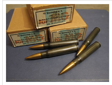
Steel cased German s.S. ball ammunition produced in 1941.