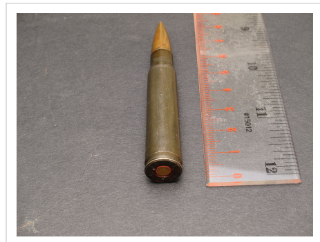
Spitzgeschoß mit Kern, yellow bullet, red circular cap groove

German Spitzgeschoss mit Kern armor-piercing bullets were also very good, being very stable and accurate at long ranges. The most common type of armor-piercing round had a hardened-steel core with plated-steel jacket and weighed 11.5 grams (177 gr). Other types appeared which used tungsten carbide and combinations for cores. Sintered iron and mild steel cores also came into use in ball ammunition.