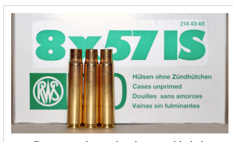
German made unprimed cases with their packaging box displaying the C.I.P. 8 \times 57 IS cartridge designation.

Warning: the 8 \times 57 IS and 8 \times 57 I (other non-military issued rifle cartridge developed by civilians after the 8 \times 57 IS) are not the same cartridge and are not interchangeable. To avoid catastrophic firearm